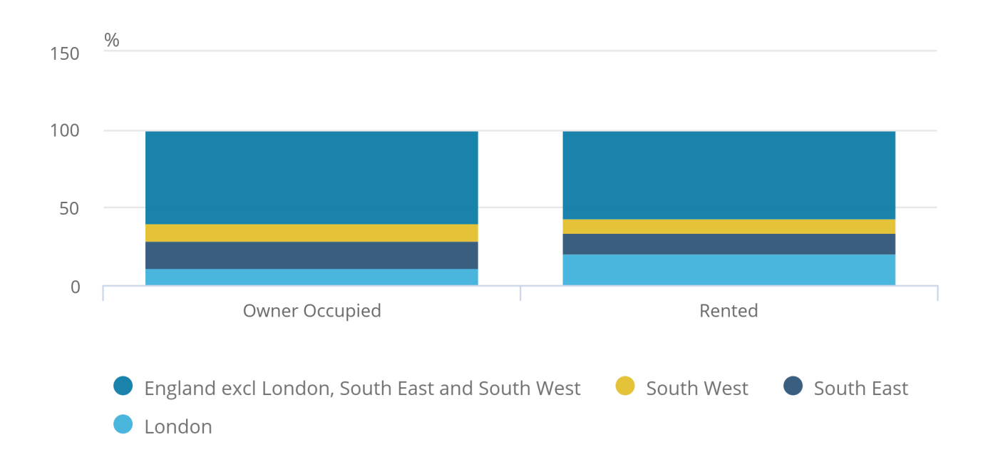
Figure 4: Dwelling stock proportions, by tenure and region